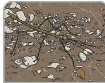
in and on soil