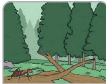
inside rotting wood